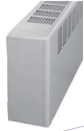
Model R Front and Top Outlet