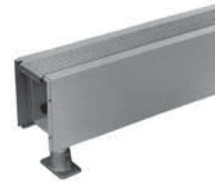
Model PA Pedestal Mounted Aluminum Grille