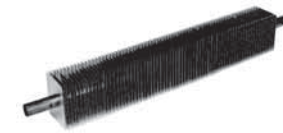
Copper Tube with Aluminum Fin Heating Element