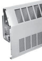
Model SF Slope Top Floor Mounted