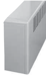
Model F Front outlet