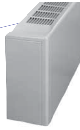
Model T Top Outlet