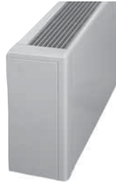
Model TA Top Outlet with Aluminum Grille