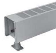
Model P Pedestal Mounted