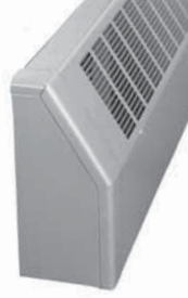
Model S Slope Top