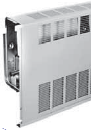
Model RF Front and Top Outlet Floor Mounted