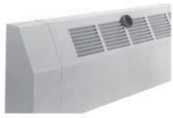
Model SP Trimfin®